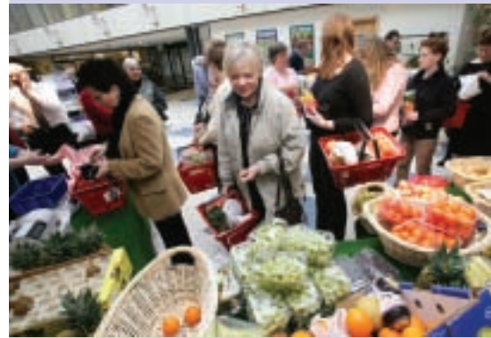
Members of the public and staff take advantage of the Food Co-op at Strathbrock